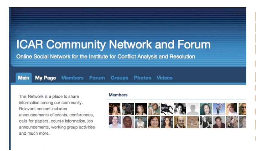
Image Above: ICAR Forum Homepage, Image on Lower Right: ICAR Groups

The network is searchable, making it easy to find members of the ICAR community with particular interests and specialties. For alums, it's a great way to find ICAR folks who are practitioners